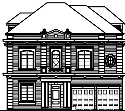
50' FRONT ELEVATION 'A'