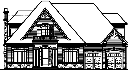
C5BUN 02 FRONT ELEVATION 'A'