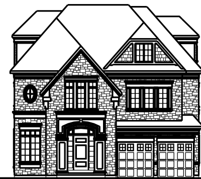
50' FRONT ELEVATION 'B'