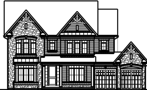
C5TS 01 FRONT ELEVATION 'B'