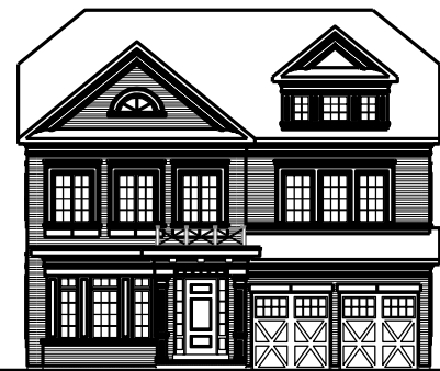
50' FRONT ELEVATION 'A'