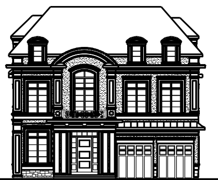
50' FRONT ELEVATION 'C'