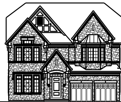
50' FRONT ELEVATION 'B'