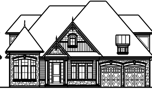
C5BUN 03 W/ LOFT FRONT ELEVATION 'A'