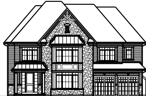
C5TS 04 FRONT ELEVATION 'B'