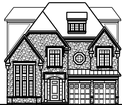
50' FRONT ELEVATION 'B'