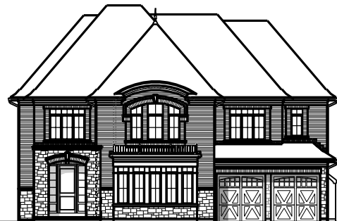
C5TS 04 FRONT ELEVATION 'A'