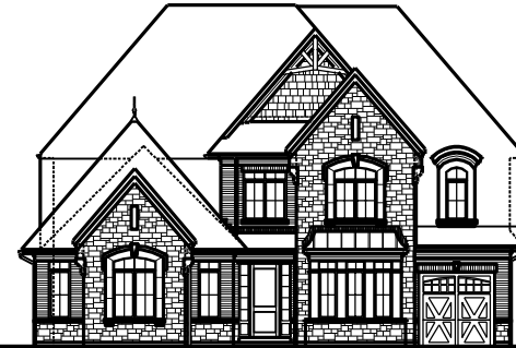
C5TS 03 FRONT ELEVATION 'A'