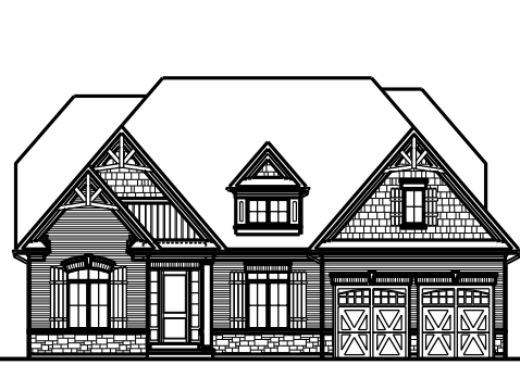
C5BUN 01 FRONT ELEVATION 'A'