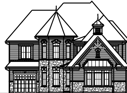
C5TS 07 FRONT ELEVATION 'A'