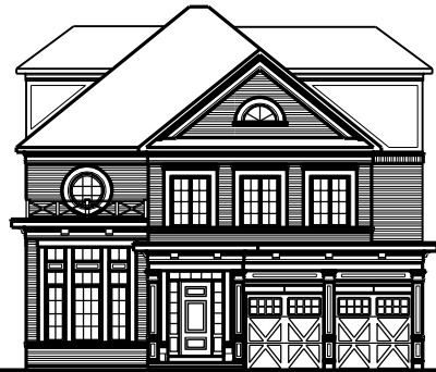
50' FRONT ELEVATION 'A'