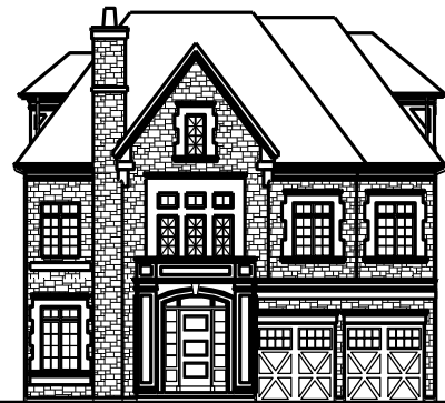
50' FRONT ELEVATION 'B'