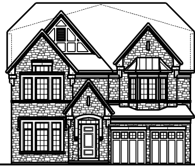
50' FRONT ELEVATION 'B'