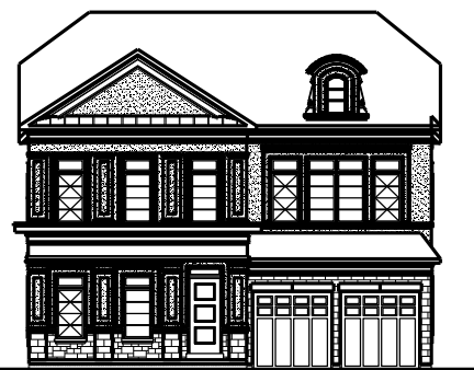
50' FRONT ELEVATION 'C'

NOTE: CONTEMPORARY ELEVATIONS ARE UNDER EVALUATION.