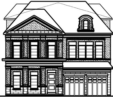
50' FRONT ELEVATION 'C'