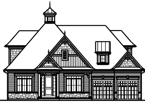
C5BUN 01 FRONT ELEVATION 'B'