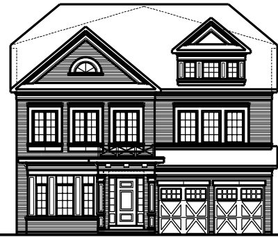
50' FRONT ELEVATION 'A'

J:\040 | THU FEB 26 15 12:10 PM | K:\PROJECTS\2016\215009\GERANIUM\STREETSCAPES\215009-SAMPLE ELEVATION SHEET.DWG