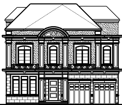
50' FRONT ELEVATION 'C'