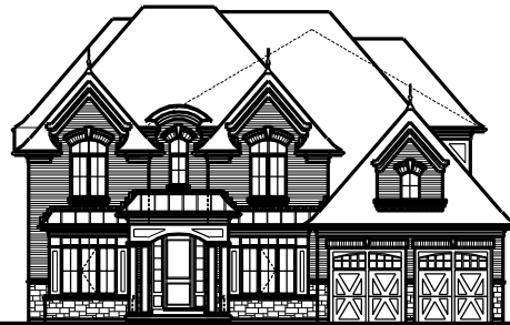
C5TS 02 FRONT ELEVATION 'A'