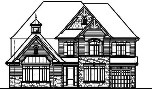
C5TS 03 FRONT ELEVATION 'B'