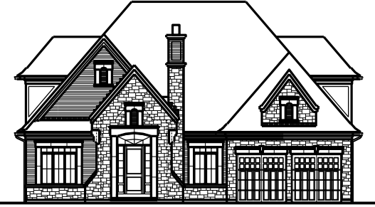
C5BUN 03 W/ LOFT FRONT ELEVATION 'B'