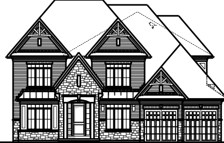
C5TS 02 FRONT ELEVATION 'B'