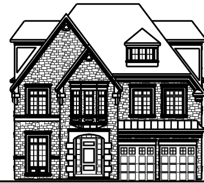
50' FRONT ELEVATION 'B'