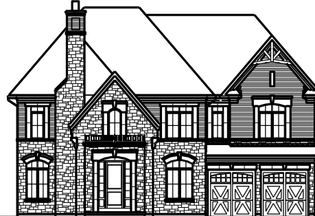
C5TS 06 FRONT ELEVATION 'A'