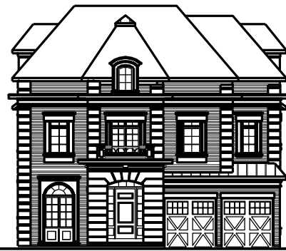
50' FRONT ELEVATION 'A'