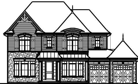
C5TS 01 FRONT ELEVATION 'A'