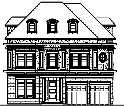
50' FRONT ELEVATION 'C'