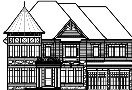
C5TS 06 FRONT ELEVATION 'B'