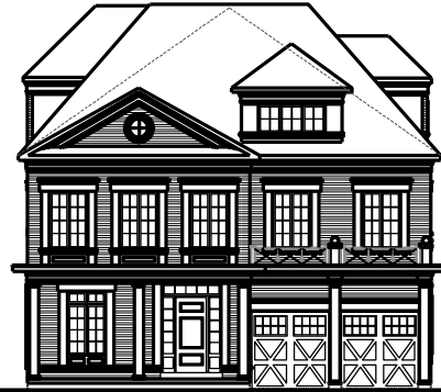
50' FRONT ELEVATION 'A'